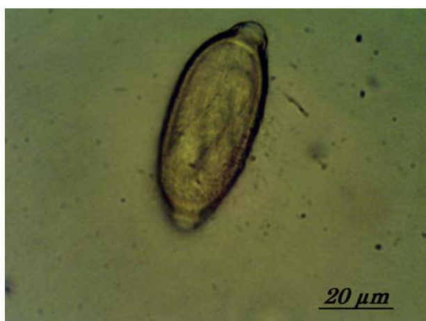
Fig. 2. Egg nematodes of the species Aonchotheca bovis of the control culture with the formed larvae at day 27 of the experiment

At the same time, in the control culture, in 79.0% of eggs of capillaries, until the end of the experiment, the formed larva (Fig. 2), which was actively moving under the influence of heat on it, was detected.